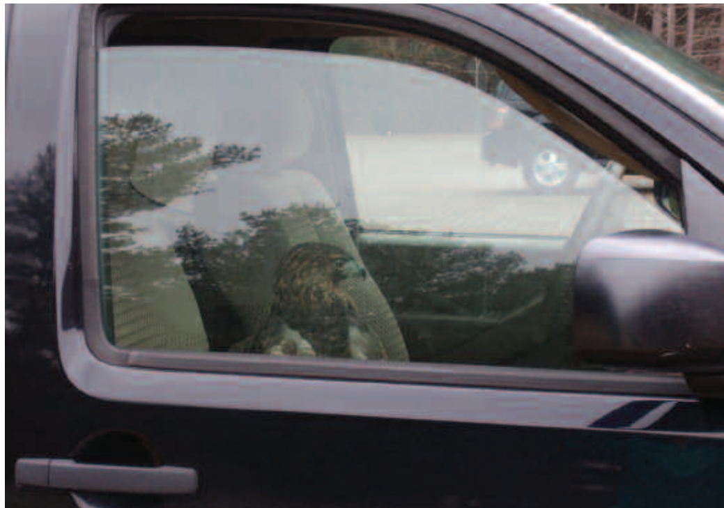
The Red-tailed Hawk arriving at WINC in the front seat of a truck.