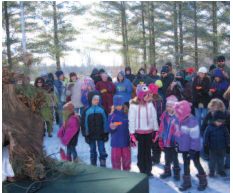
Young guests anxiously wait to awaken Waldo.

This was the first time that the Groundhog Day event was held at the Center. Thank you to all volunteers who helped direct traffic, park cars, hand out fliers and handle ambassadors. Without our volunteers these types of events would not be possible!