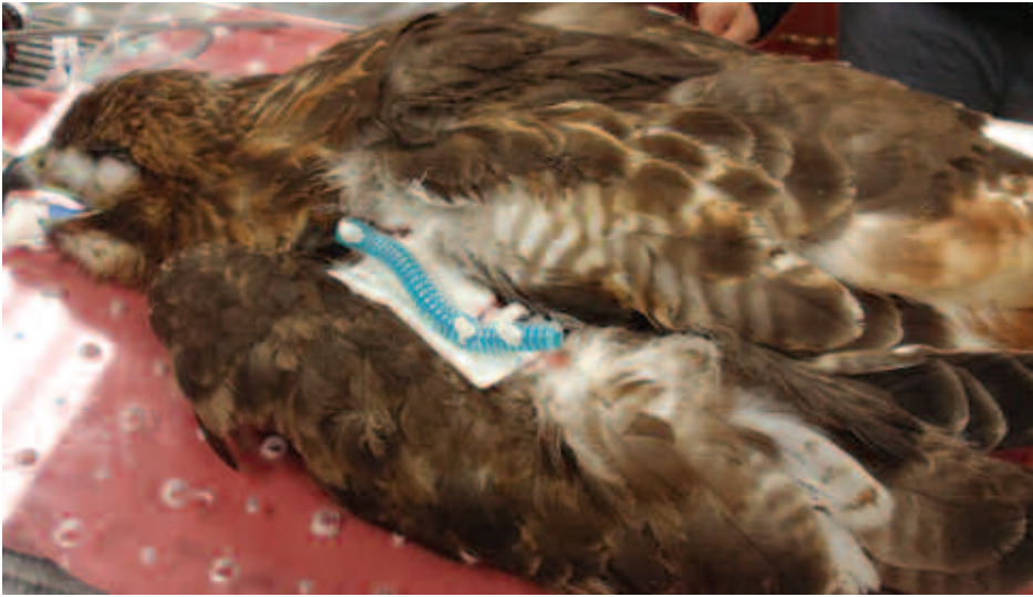
After surgery, once the fracture had been stabilized with pins.

The surgery was considerably more complicated than anticipated, lasting almost 4 hours. Eventually, the bone ends were pulled together with pins and the fracture was stabilized. The hawk was confined to strict cage rest for five weeks while the fracture calcified.