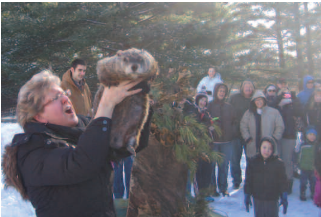
Waldo predicts six more weeks of winter in front of a record attendance for this event!.