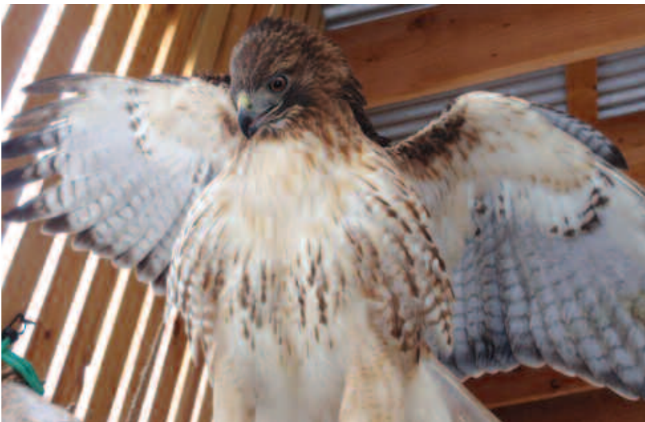
Enjoying stretching his wings in our largest flight enclosure!

After two weeks in our indoor/outdoor enclosure, and a final round of positive x-rays, our patient was ready for our largest flight enclosure, where he will be on a daily exercise schedule. He has made amazing progress thus far and we remain hopeful for his release. *Follow this and other WINC stories on Facebook to read more about this hawk and stories of our other patients.*