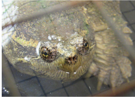
Our currently longest-term patient, poking her nose out of the water.

2013, when she suffered a carapace (or top shell) fracture from being hit by a car.