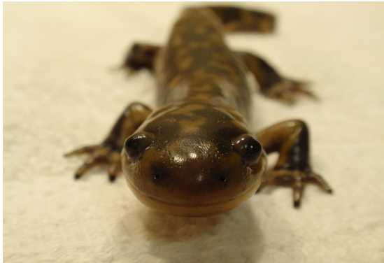
Getting up close and personal with an Eastern Tiger Salamander patient.

Four Eastern Tiger Salamanders were calling WINC home temporarily. One was found in the grass outside and three were found in a wood pile in someone's basement. Two of these little smiling cuties had minor toe injuries, which have now healed.