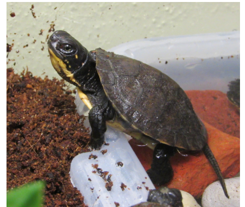
A Blandings Hatchling, which is only the size of a Post-It Note!

Along with the snapping turtle mentioned above, we also had another snapping turtle with a carapace fracture from being hit by a car. Four Blandings turtle hatchlings and 5 painted turtles comprised our turtle patients. The Blandings turtles were found as eggs in northern Wisconsin last fall and, when they hatched, they were brought to us for care. Blandings turtles were recently taken off the endangered species list so they were a unique patient to admit! The Painted turtles arrived at our Center through a variety of circumstances; one had a fractured carapace from a vehicle hit, one was found stranded in a parking lot, and three were brought to us as unwanted pets.