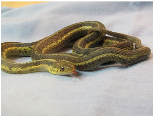
Our Common Garter Snake, enjoying the bountiful heat at WINC.

Wild herps are not meant to be kept in captivity as pets. They fare far better in the wild where they were meant to be and require very unique and intensive care that only licensed rehabilitators have experience in. If you find any of these little critters in or around your house from November to April, please call WINC if you are in our neck of the woods or call your local wildlife rehabilitator. To capture and transport safely, place the herp into a box (with air holes) with damp bedding on the bottom. Keep them in a quiet, dark place until you can contact a rehabilitator, preferably within 24 hours.