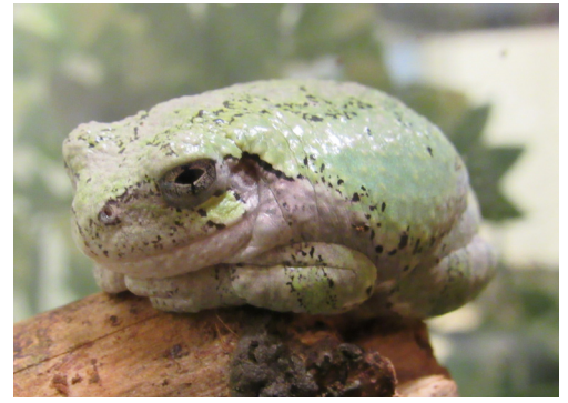
Our resident Eastern Gray Tree Frog, dressed in a minty green shade for its photo shoot.

There was also an Eastern Gray Tree Frog in our herp room. He was also brought to us as an unwanted pet. He changes colors like a chameleon so it was fun for the staff and volunteers to see what he looked like from day to day.