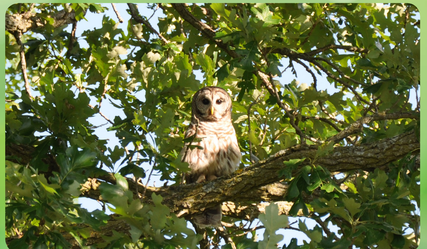
Top left: Orphaned baby birds in the avian nursery