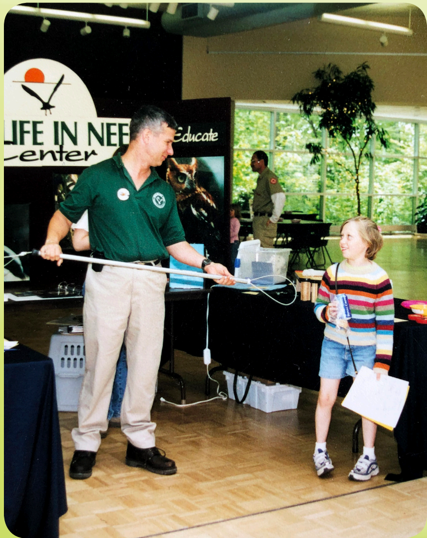
Left: Early education and awareness booth