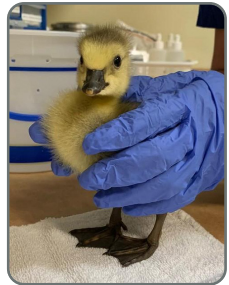
Orphaned Gosling successfully Wild Fostered

With just as many animals in need as any normal year but without the volunteer or intern support we typically have, our Animal Care staff started looking more at the Wild-Fostering of more species than just the Canada Goose as a way to provide care for the infants entrusted to us. With research while working from home and our homebound volunteers to scout for nests of Eastern Cottontails or song birds, we hope to perform educated and controlled wild fosterings of new species. In the first week of June while this article is being written a successful wild foster of four Wood Ducklings was completed, expanding the spectrum of species that Wild-fostering can be successfully used for as well as providing more evidence for the potential for this type of program.