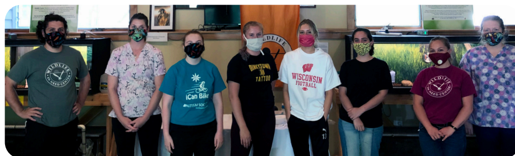
One of WINC's three Animal Care Teams. Team C is pictured above, and Team A is pictured in the top right corner.