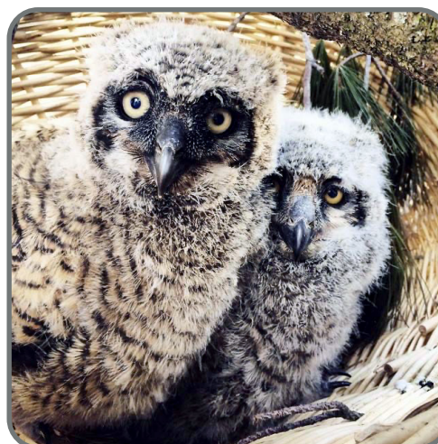
Re-nesting one Great Horned Owl and successful Wild Foster of a Great Horned in the same new nest in 2015.