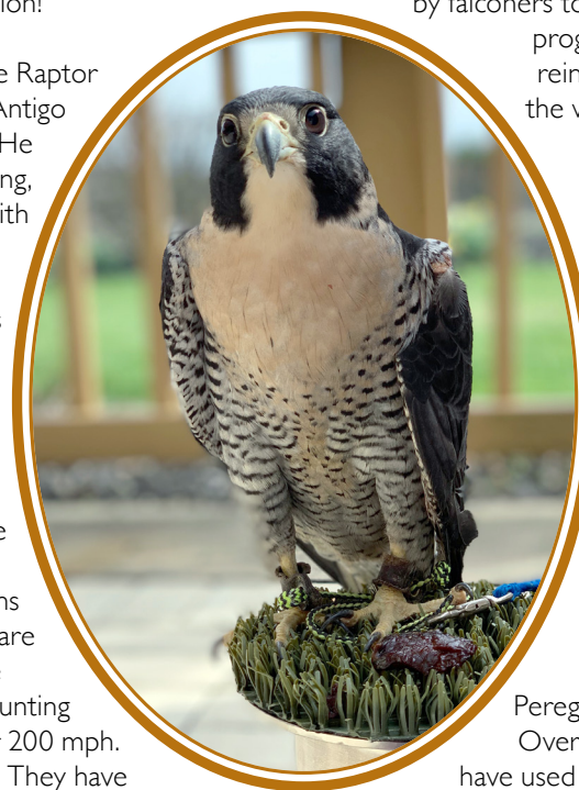
Otis the Peregrine Falcon!

They are also a wonderful comeback story when it comes to conservation. By the 1960's, Peregrine Falcon populations in the eastern United States were wiped out because of the pesticide DDT. DDT affected the female's ability to lay healthy eggs causing the populations to crash.