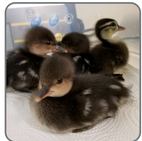
Successful Wild Foster of Wood Ducklings