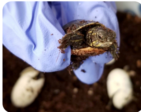
Top photo: Collected eggs in an ice cream bucket in an incubator Bottom photo: A Common Snapping Turtle hatchling from our incubator

with a mixture of soil and vermiculite and put into one of our many incubators. For the months of June and July, staff check these buckets weekly. Weekly checks include spritzing the eggs with filtered water to ensure high humidity and examining eggs to ensure viability. Starting in August, weekly checks become daily checks to see who hatched overnight or we get lucky and see turtles actively hatch.