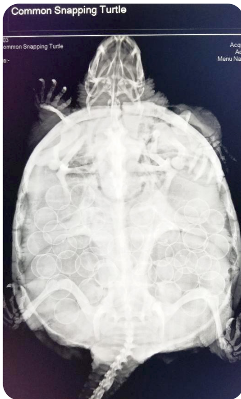
X-Ray of a female Common Snapping Turtle showing that she is carrying eggs

Once the eggs have been collected, they are put into a labeled ice cream bucket lined