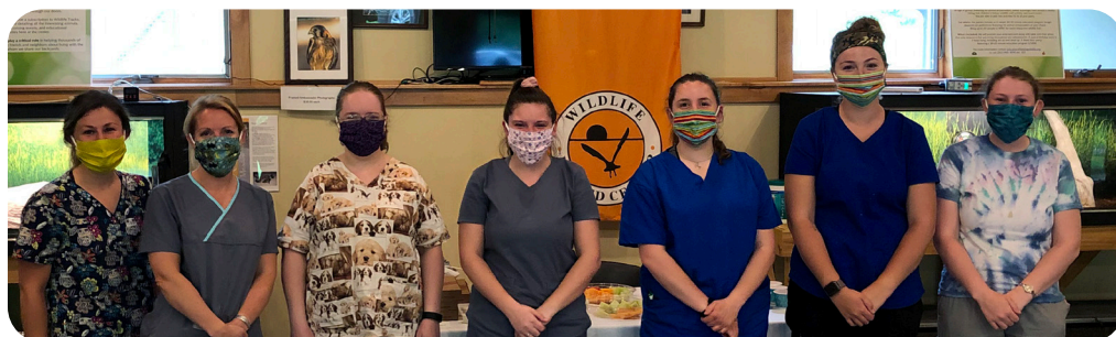
One of WINC's three Animal Care Teams. Team B is pictured above.