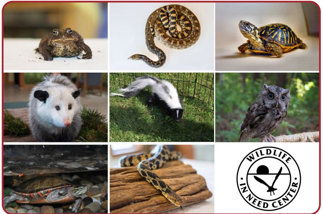
Some of the Wildlife In Need Center's Educational Animal Ambassadors (from left to right): Bella the American Toad, Meadow the Bullsnake, Jewel the Ornate Box Turtle, Marcy the Virginia Opossum, Chase the Striped Skunk, Chloe the Eastern Screech Owl, Antoinette the Western Painted Turtle, and Evie the Eastern Fox Snake

Educating Virtually? With Live Animals? Yes!