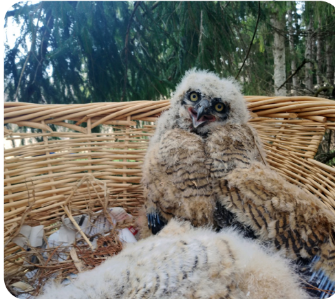
Great Horned Owl Re-nesting during the time WINC was closed to admissions

As we began our 26th year, no one knew of the impending pandemic on the horizon and the tremendous impact that it would have on the entire world—every person, business and organization.